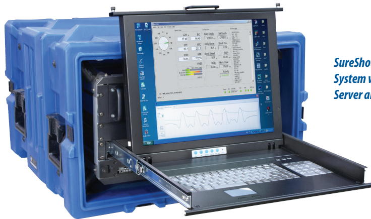
SureShot Ruggedized System with Integrated Server and Terminal